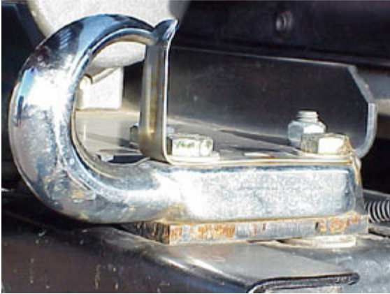
Example of bolts under single shear load