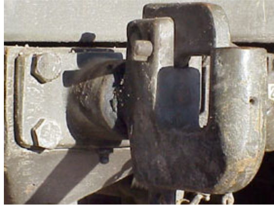
Example of bolts under tension

Let's look at an example of where grade 5 and grade 8 bolts are subjected to single shear loads (winch plate reference).